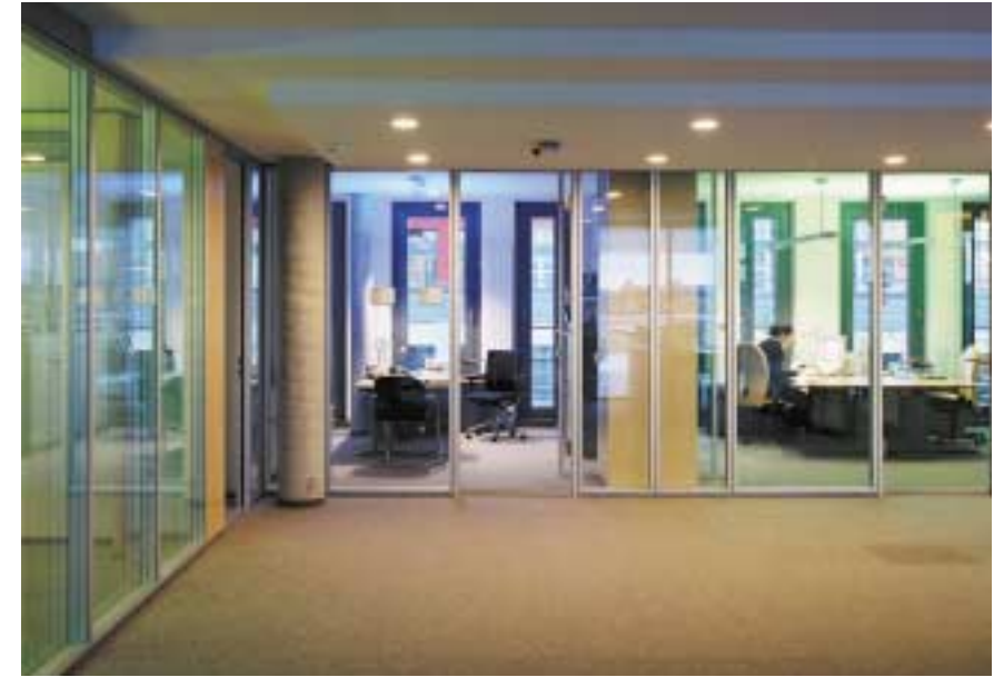
The primary aim of this project was to produce 'good individualized office lighting.' The idea of the RGB luminaire was to replicate the dynamic quality of daylight through the variable composition of luminous colours and light intensities with a high-tech luminaire design. The pictures depict different "lighting moods" produced by indirect lighting components.