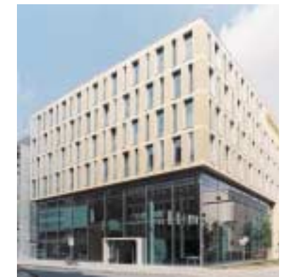
The new office building for the Berlin Medical Society is located in the heart of Berlin/D.

With the advent of electricity and electrically activated light sources, work has become increasingly independent of daylight. This move towards artificial light sources has led to the alienation of our natural predetermined circadian rhythms and has been imbibed so well in our daily lives that it appears that we have forgotten previous diurnal cycles. And yet, despite numerous technical innovations and developments, daylight is still preferred to artificial light – a fact that continues to baffle many experienced lighting specialists, especially those with an engineering background.